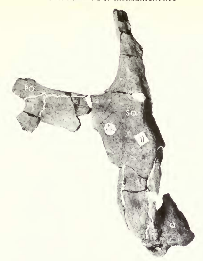
Fig. 3 Kimmerosaurus langhami Brown, R.1798. Fragment of left cheek in lateral aspect, \times \frac{2}{3} . J, jugal; PO, postorbital; Q, quadrate; SQ, squamosal.

appears fused onto this surface, showing the diagnostic manner of union of these elements. In R.8431 the anterior ramus of the squamosal on both sides terminates at the sutural surface, but on R.1798 posterior fragments of the postorbital and jugal elements remain attached, and anteriorly between these elements, on both sides, a part of the margin of the orbit is preserved. The orbital margin is only 12 mm anterior to the middle of the suture on the squamosal.